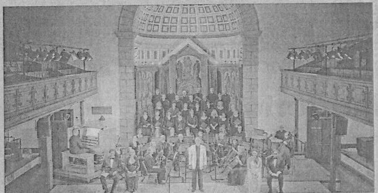
The Bach Choir and Orchestra are at St James this Saturday.

● The concert takes place at St James this Saturday at 8pm. Tickets are £12 and those for senior citizens, students and restricted view cost £10. They are available from the booking office on 711361 and www.guernseytickets.gg .